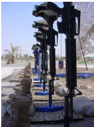
A Warrior’s End

We can ponder the significance of “A Warrior’s End” from many perspectives. There is the look on a mother’s face that can never be forgotten when she is told she will never hug her beloved son again; or the empty side of the bed that grieves the young wife’s heart; the empty chair at the dinner table where Daddy used to sit. If we can introduce each one of these young men and women to the Gospel